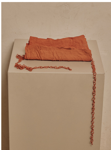
Before It Goes, 2022 terracotta 9 × 30 × 10cm $1400