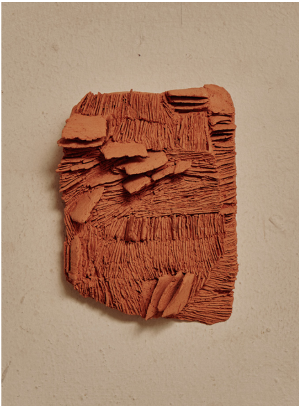
Carving III, 2022 terracotta 14 × 10 × 5cm $680