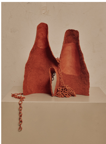
With You, 2022 terracotta 29 × 28 × 14cm $1600