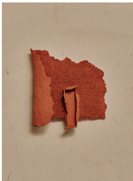
Long Ago, Clear As Day, 2022 terracotta 12 × 11 × 4cm $620