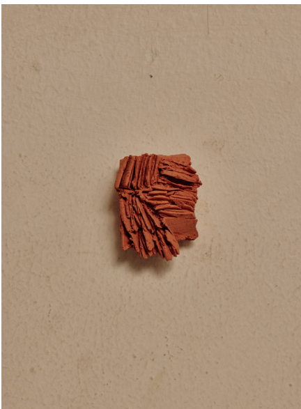
Moment II, 2022 terracotta 4.5 × 3.5 × 2.5cm $120