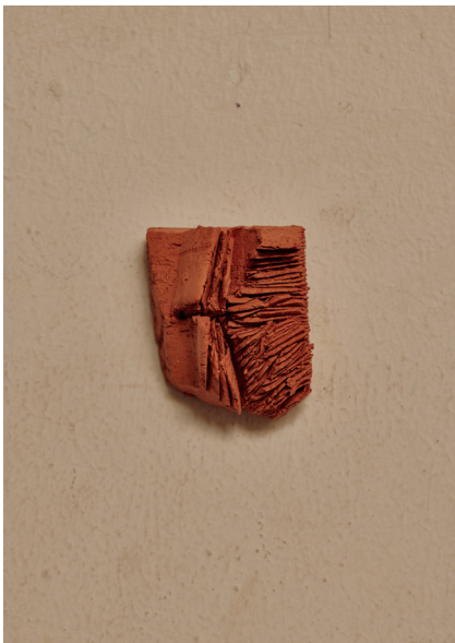
Moment VI, 2022 terracotta 5.5 × 4 × 2.5cm $120