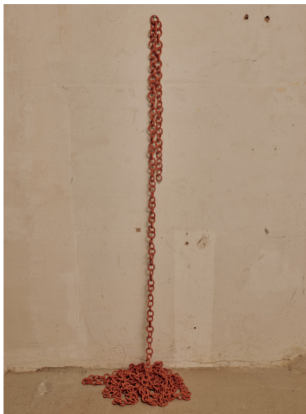
Thought Thread, 2022 terracotta 900 × 4 × 0.5cm $1400

All sales and enquiries facilitated via Stockroom Kyneton enquiries@stockroom.space