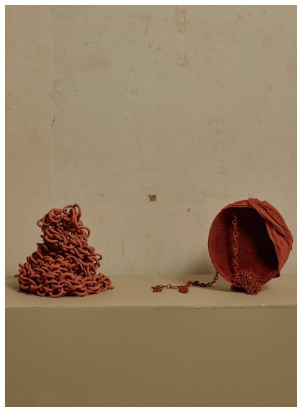
Scaled, 2022 terracotta 20 × 30 × 25cm 27 × 25 × 18cm $3500