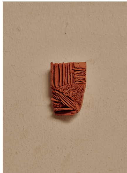
Moment VII, 2022 terracotta 5 × 4 × 2.5cm $120