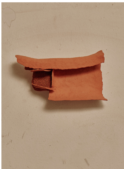
Wind On Face, 2022 terracotta 9 × 11 × 7cm $620