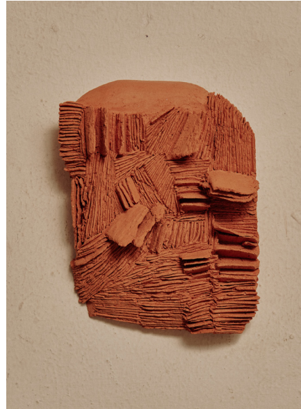
Carving II, 2022 terracotta 13 × 10 × 5cm $680