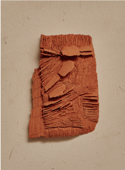
Carving I, 2022 terracotta 15 × 10 × 5cm $680

All sales and enquiries facilitated via Stockroom Kyneton enquiries@stockroom.space