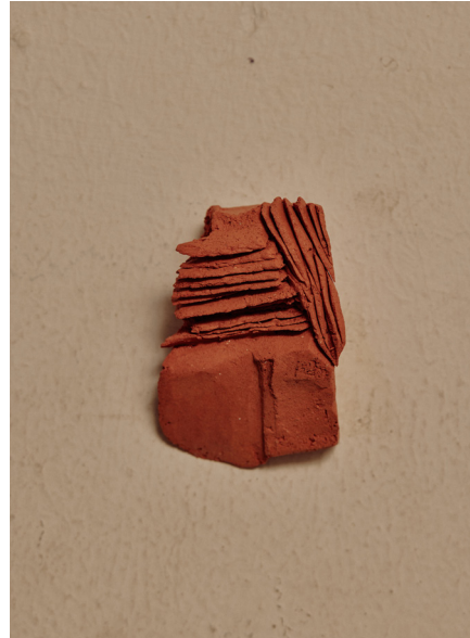
Moment V, 2022 terracotta 5.5 × 4 × 2.5cm $120