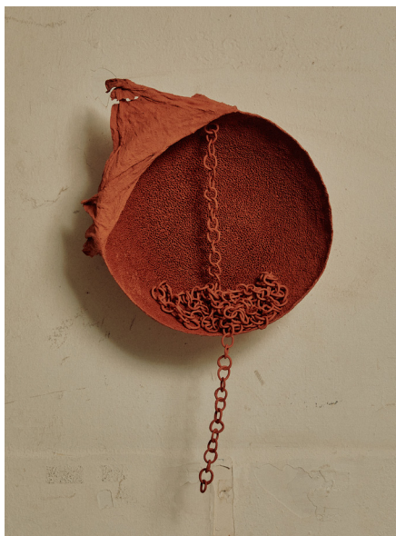
Tears Held II, 2022 terracotta 29 × 25 × 11cm $1750

All sales and enquiries facilitated via Stockroom Kyneton enquiries@stockroom.space