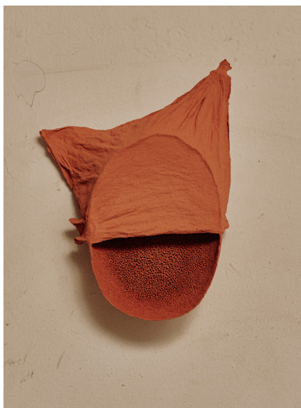
Stay Here, 2022 terracotta 24 × 17 × 6.5cm $780