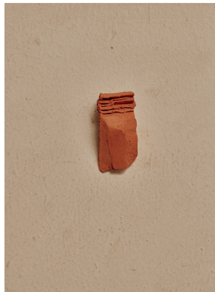
Moment IX, 2022 terracotta 5 × 2.5 × 2.5cm $120