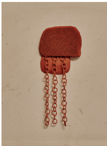
Whispered the Cloud, 2022 terracotta 25 × 11 × 3cm $620