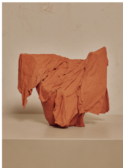
Not Here, 2022 terracotta 20 × 25 × 15cm $1200