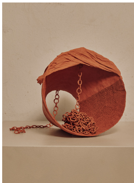
Can You See, 2022 terracotta 22 × 23 × 29cm $1400