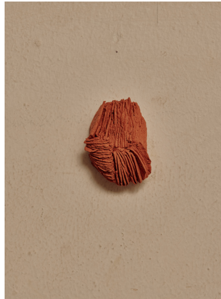
Moment I, 2022 terracotta 5 × 4 × 3cm $120