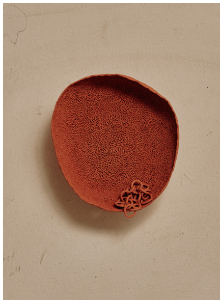
Waiting, 2022 terracotta 15 × 13 × 7cm $780