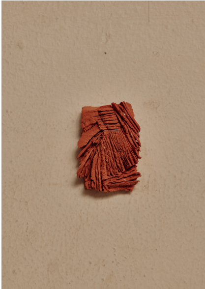
Moment IV, 2022 terracotta 5 × 3.5 × 2cm $120

All sales and enquiries facilitated via Stockroom Kyneton enquiries@stockroom.space